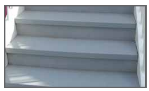
Covered stair treads, with hidden hold down clips, lead to a water slide at a municipal waterpark in Oklahoma.